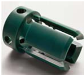
Example of a CF Plastiques finished product

Given the fragility of the objects to be handled during the manufacturing processes, CF Plastiques opted for a vacuum handling system in its CNC tooling center. At CF Plastiques production processes, the objective is to reach -900 mbars vacuum level at a quick pace to carry out the pick and place task. The vacuum system was equipped with an additional vacuum reserve so as to boost the performance vacuum generating task.